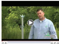
Twinflex Demo Video

Dual heavy duty steel coil springs provide stability in gusty wind conditions.